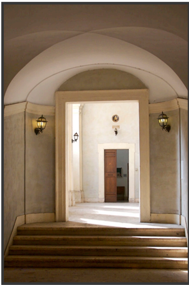
Through a Rome Doorway