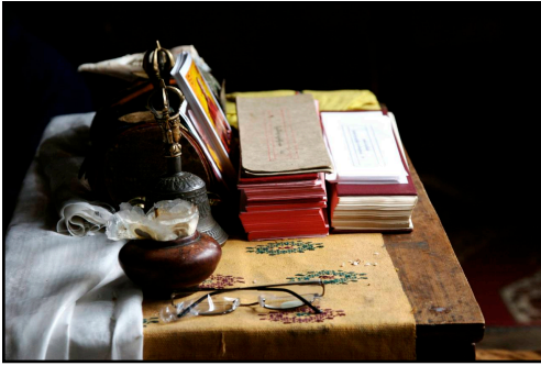
Still Life in Bhutan*