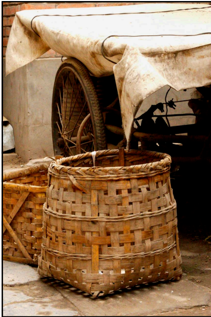
Reed Basket in Beijing